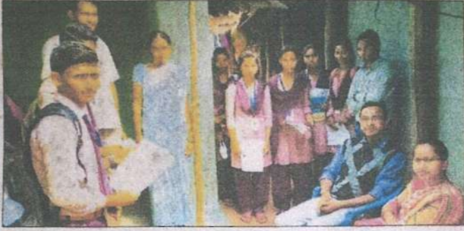
Students conducting the survey.