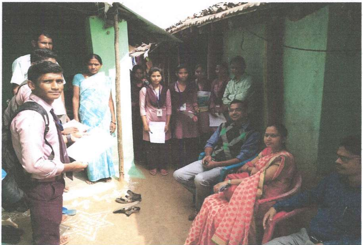
PBR Survey conducted by B. A. II students

Handwritten initials or signature in a circle.