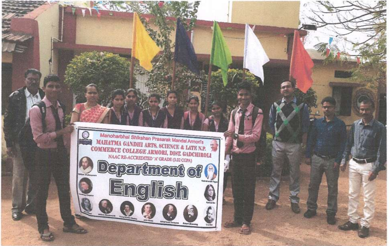
B. A. II Students in a PBR survey at Kasavi